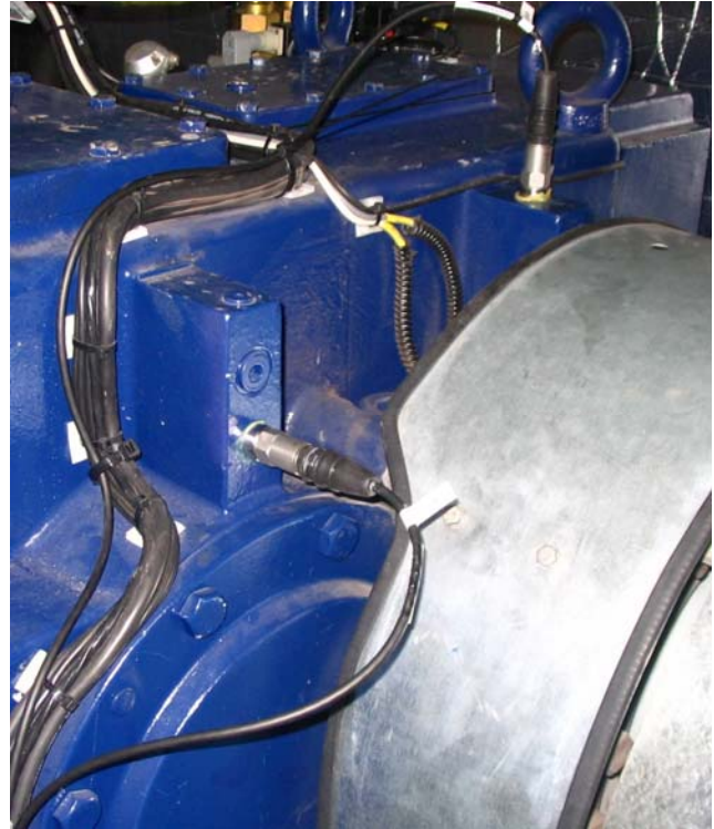
Axial & Vertical General Purpose Accelerometers Stud Mounted on Gear Box

increased rotation speeds for the gearbox and generator, a general purpose accelerometer will work. General purpose accelerometers typically provide 100 mV/g and a frequency span of 30 – 900,000 cpm (0.5 – 15,000 Hz).