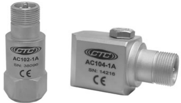
General Purpose Accelerometers