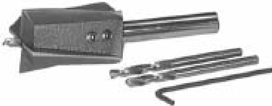
MH117 Tool for Spot Facing & Drilling