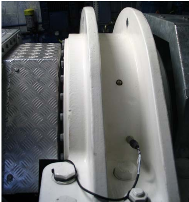
Low Frequency Accelerometer Mounted in Horizontal Axis on Main Bearing