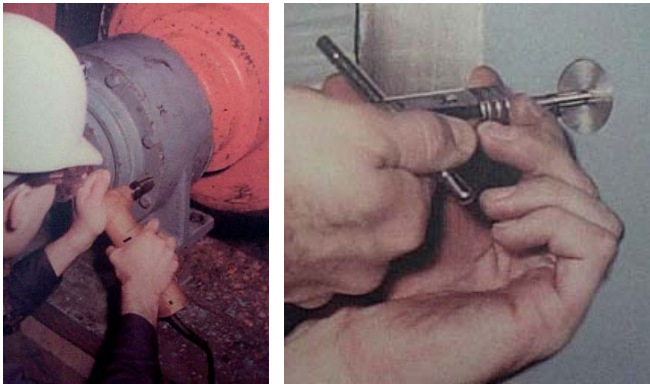
Spot Face, Drill, & then Tap

locations on the main bearing(s), gearbox, and generator should be spot faced, drilled and tapped for threaded attachment of the sensor to the machine.