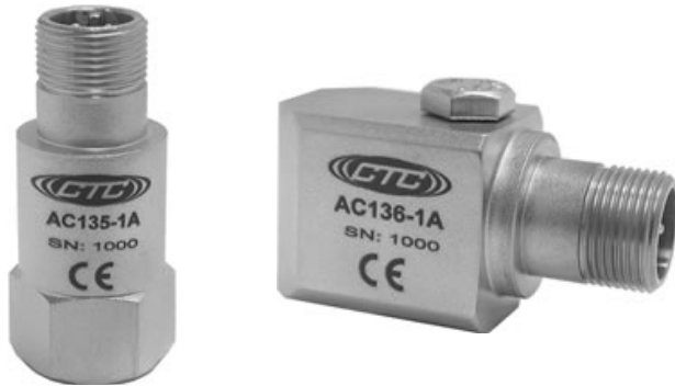
Low Frequency Accelerometers

These low frequency accelerometers typically provide 500 mV/g and a frequency span of 12 – 180,000 cpm (0.2 – 3000 Hz).