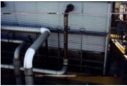
Figure 4. Cooling tower pool (located under the tower structure)

detached and damage the cell and the surrounding components. In search of a cost-efficient, timesaving alternative, Bristol-Myers Squibb and CTC (an accelerometer and vibration analysis hardware manufacturer) together investigated efficient alternative means to portable measurements. For the initial three jack-shaft-driven cooling towers, a system of low cost accelerometers mounted to mounting targets and connected to a remotely-mounted switch box was specified after consideration of a number of different issues.