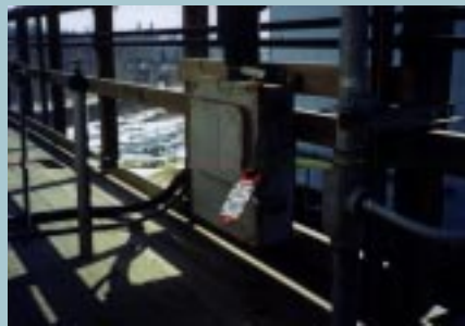
Lock-out of cooling tower fan during accelerometer placement

Safety Considerations . Safety is paramount at Bristol-Myers Squibb. The Safety Department requires certain Protective Personnel Equipment (PPE) for all employees, contractors, or visitors working or visiting in pre-designated hazardous areas. For the jackshaft driven cooling towers, a Confined Entry Permit was required prior to accessing the cells for collection of data on the gearbox and fans. special cleats were needed to ensure secure footing on the wet catwalks. Harnesses were required to be worn by the vibration analyst while in the cooling tower cell to reduce the risk of injury if footing was lost. Hard hats and protective eye-glasses were also required to ensure the safety of the analyst. Additionally a second person was required to be present while the analyst was inside the cell to ensure the analyst's safety. Finally, the analyst, to prevent a premature startup of the cooling tower fan, locked out the cooling tower cell prior to the entry into the cell (see figure below).